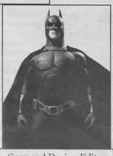
Copy and Design Editor

You may not have super powers but you can have the power of the press. Be a Campus Chronicle editor or manager! Submit a letter of interest for all editorial positions to news@highpoint.edu by March 1