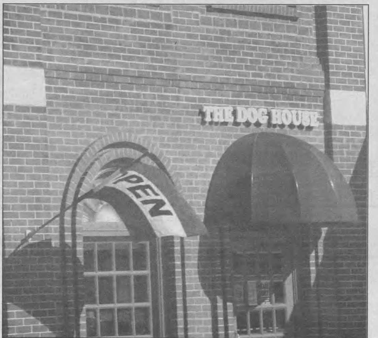
If you go to the Dog House you can eat in a booth themed for your favorite ACC team but you can't pay with a credit card.

Ready to eat? Bring cash as no checks or cards are accepted. Also, remember to give yourself a little extra time if you have classes. There is more than likely going to be a wait.